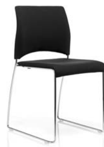
Upholstered seat and back