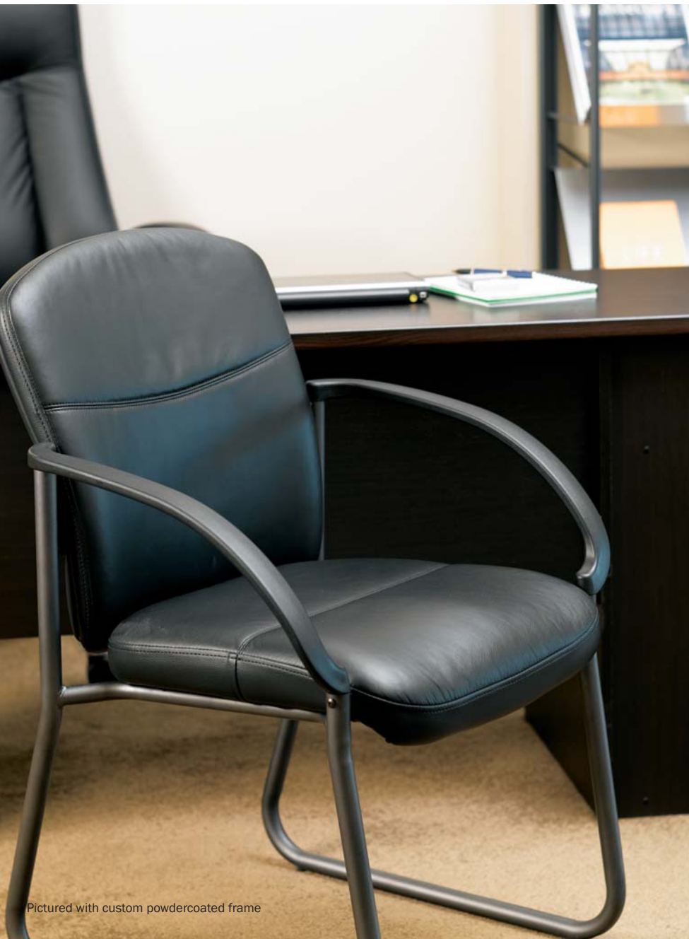
Pictured with custom powdercoated frame