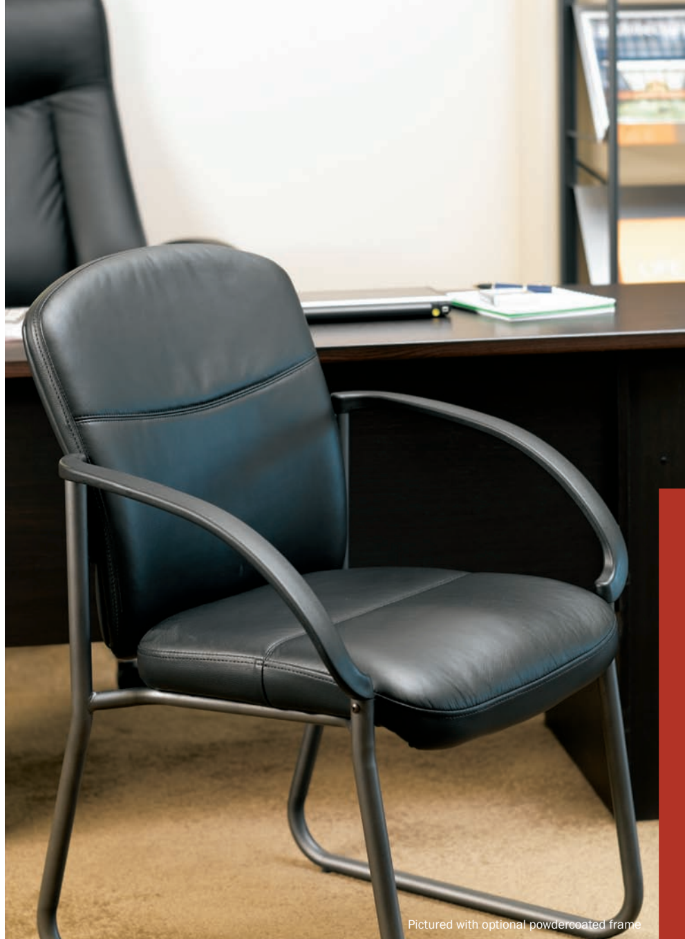
Pictured with optional powdercoated frame